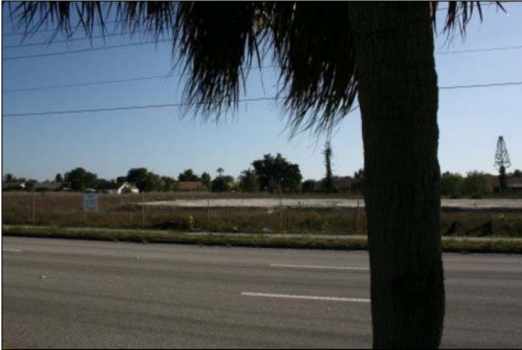
Typical Street Scene of the Subject